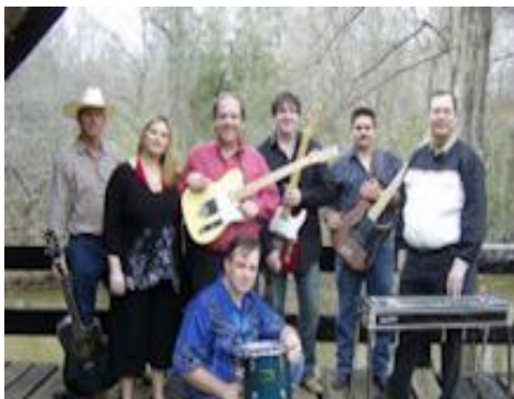
The Filmores House Band "Bringing the best in Country Music for 16 Years"